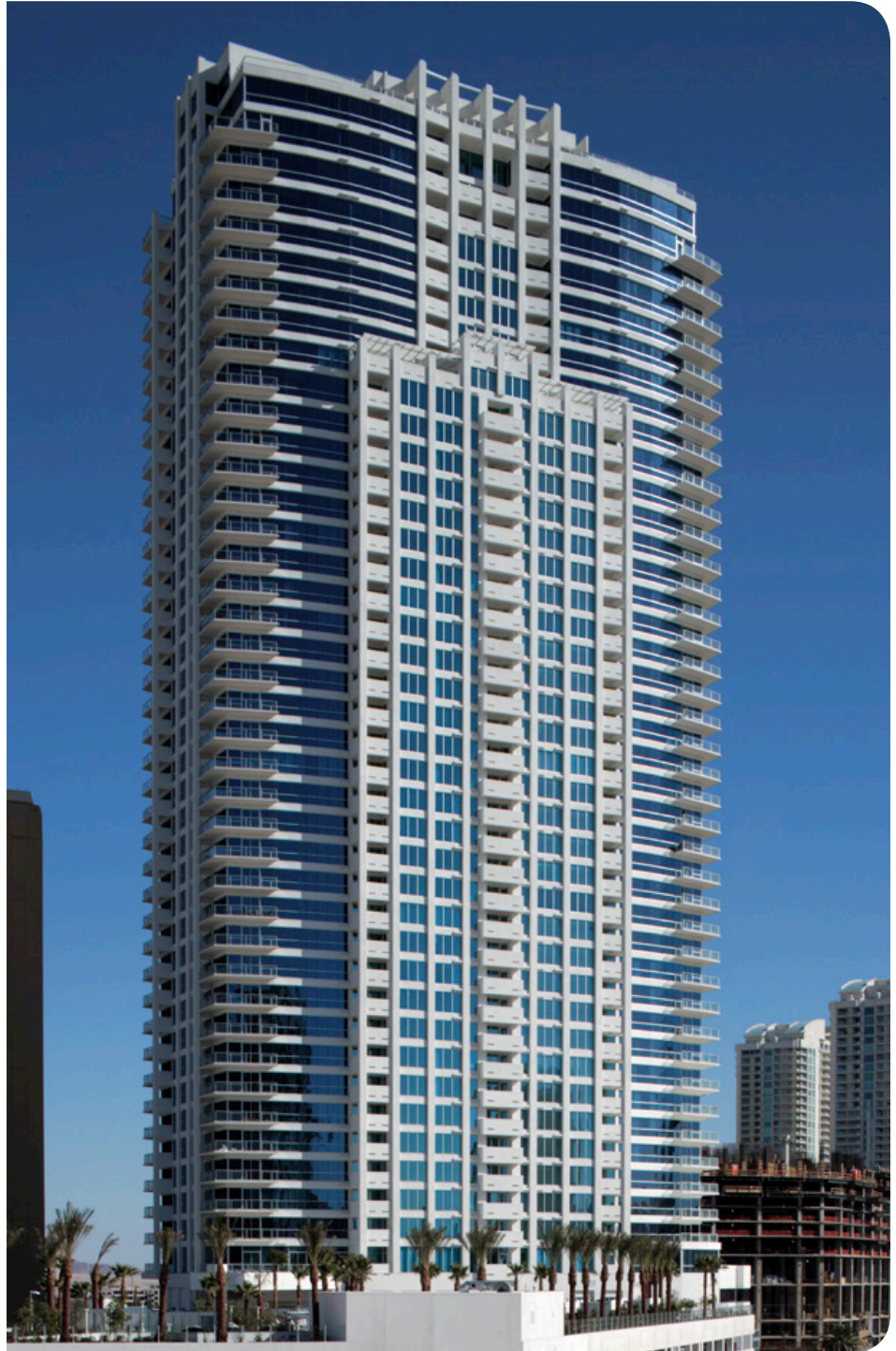
Sky Las Vegas, a luxury high-rise on the Las Vegas Strip, combines Vistacool® Azuria® glass and blue-tinted glass over Solarban® 60 glass to maximize views and energy efficiency.

"This was a special 3-acre site directly on Las Vegas Boulevard, and our goal was to maximize views from every angle of the building," he said. "We were looking to incorporate as much glass as possible into our design so that discriminating buyers would have their own personal window to the views."